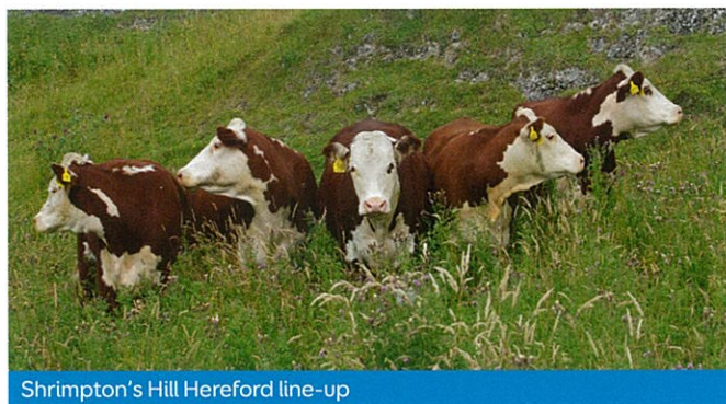
Shrimpton's Hill Hereford line-up

LIC geneticists, along with the McKerchars, were acutely aware that the dairy industry needed a natural solution to help later calving dairy cows in seasonal calving herds regain lost ground in calving pattern.